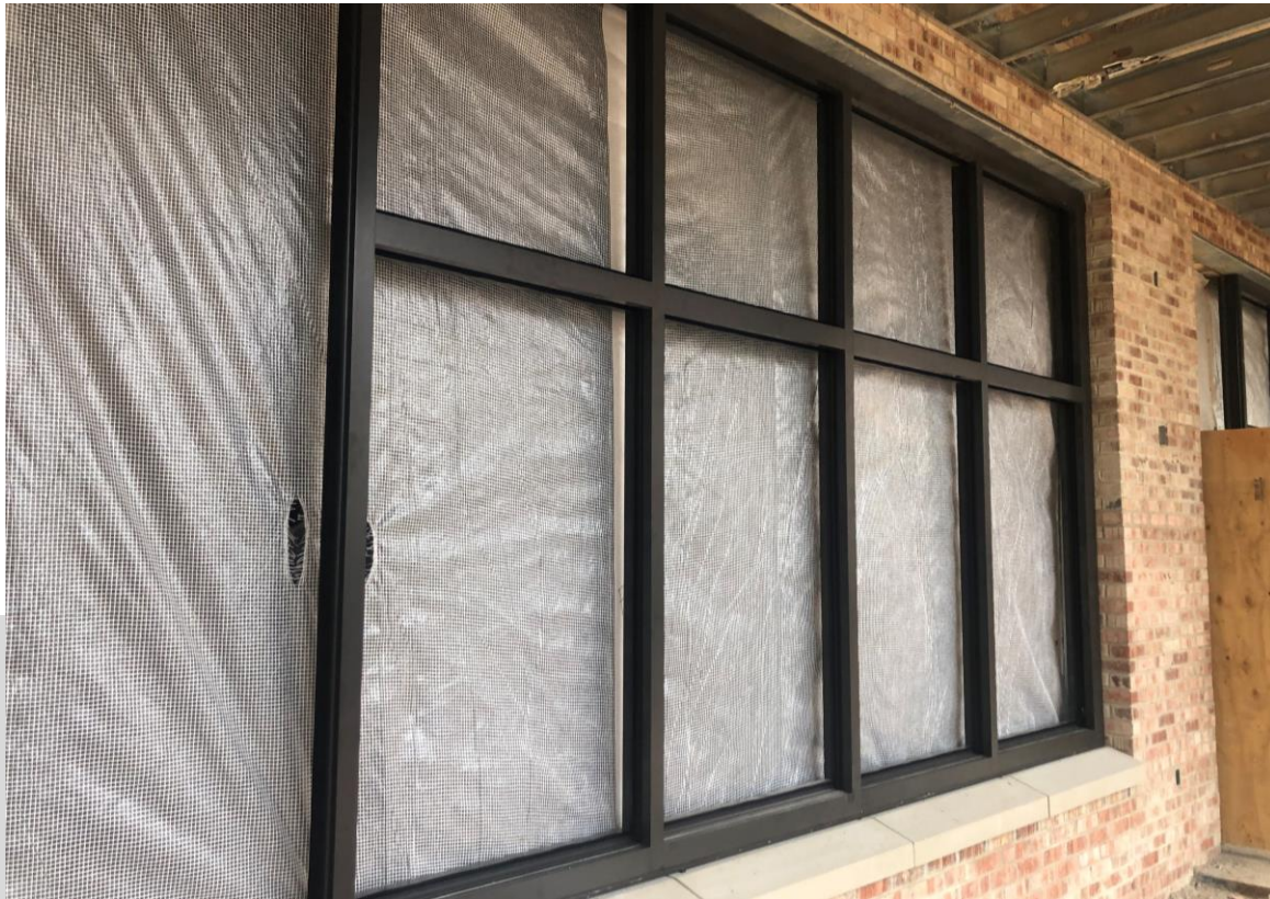
Storefront Frames Installed at South Elevation