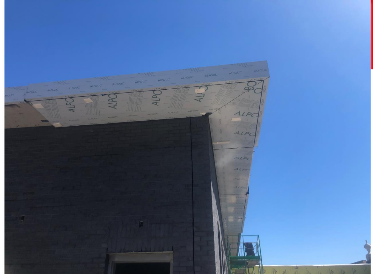
ACM Metal Panel Progress at South West Elevation