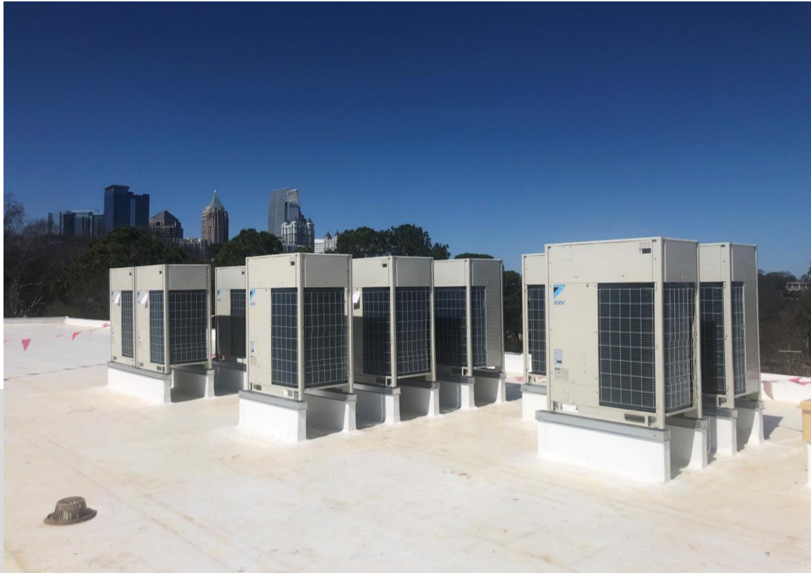
HVAC Units Set on New Addition Rooftop